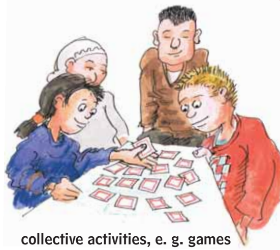
collective activities, e. g. games