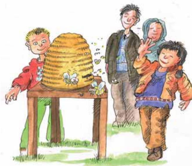
excursions to extracurricular places of learning, e.g. visiting the Schulbiologiezentrum