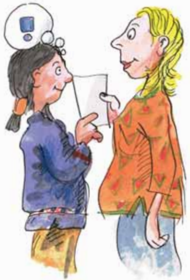
Talk with each other – talking and asking questions